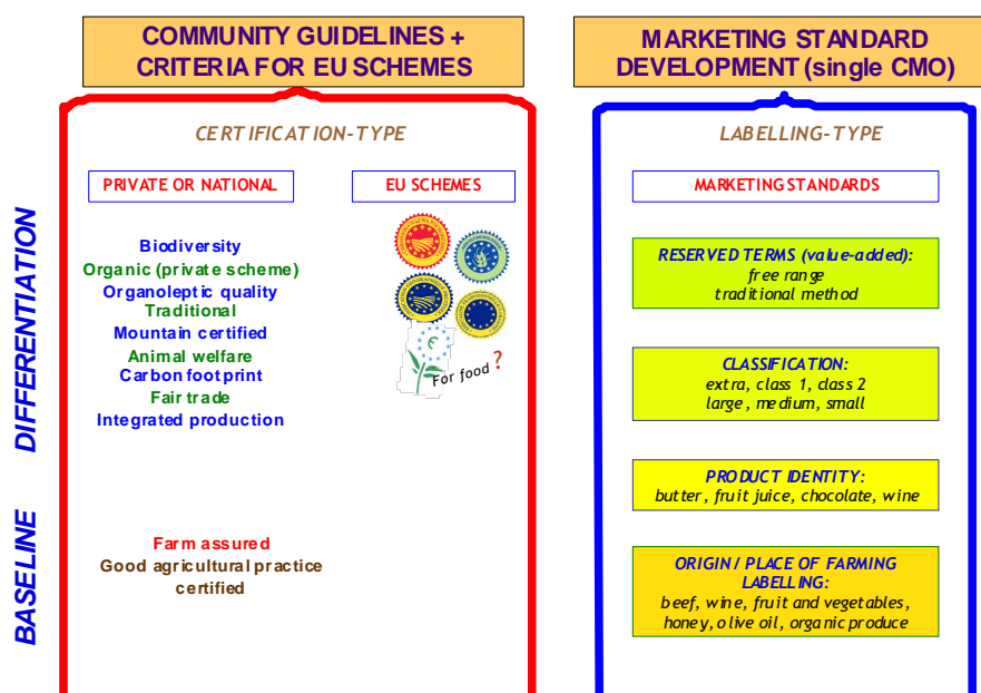
Figure 2. Structure for development of agricultural quality and assurance certification schemes and marketing standards